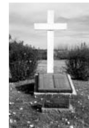
Father Lacombe's heart is now buried in the cemetery behind Providence Residence.