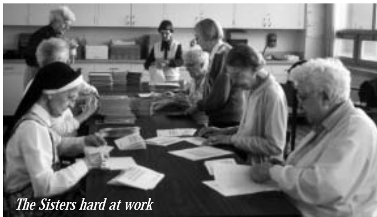
The Sisters hard at work

The Sisters thank all the Catholic school districts in Alberta for ensuring each of their schools received a copy of the book. ☩