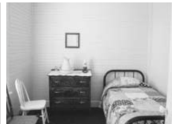
One of the two bedrooms in the cottage. The Sisters today continue to use the cottage as a place of retreat.