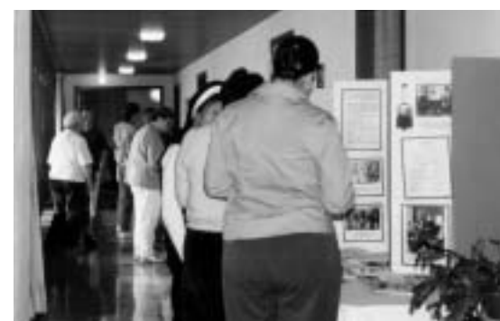
Displays lined the hallway for visitors to view and learn more about the Sisters of Providence.

Father Lacombe, but said she was not aware of the extent of their works. "I guess I just assumed this was the only place these Sisters were involved in. I was surprised to see all the displays and see everything they have done and are still doing. These are strong women."