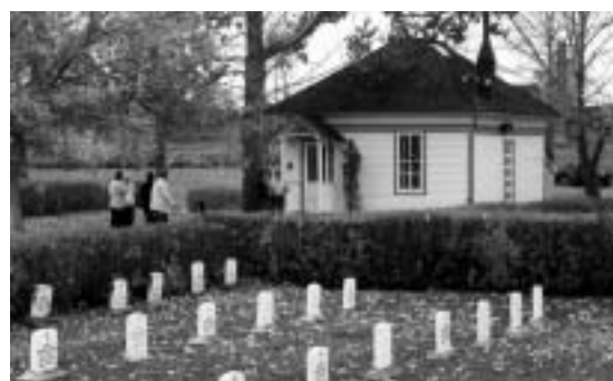
The cottage was opened to visitors during the Open House on October 8, 2003.