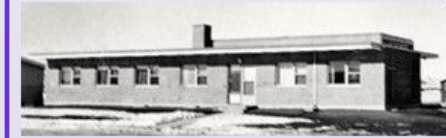
1958 St. Mary's Convent, Taber, AB