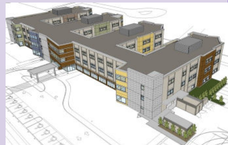
2013 Providence Care Centre Calgary, AB

Mother Emilie Gamelin, foundress of the Sisters of Providence, understood what it was like to be needy and suffering; she lost both parents when she was very young and had to rely on the charity of relatives for her care and education. After the loss of her husband and three young children, she organized with a group of women and devoted her life to service and caring for the needy.