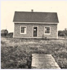
1953 St. Anne Convent Joussard, AB