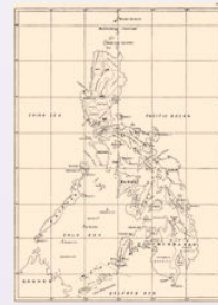
1989 Holy Angels Province administration of Philippine Sector