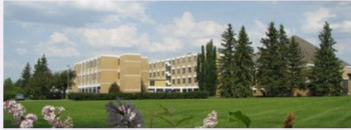
1965 Providence Centre Edmonton, AB