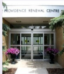
1982 Providence Renewal Centre Edmonton, AB