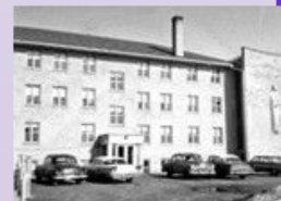
1962 Providence Ste. Therese Otterburne, MB