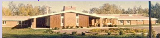
1967 Gamelin Nursing Home High Prairie, AB