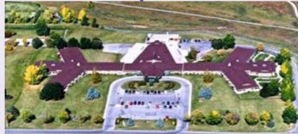
1965 Father Lacombe Nursing Home Calgary, AB