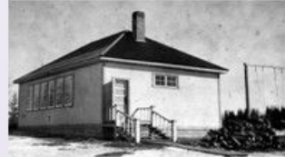
1954 St. Charles Mission Wabasca, AB