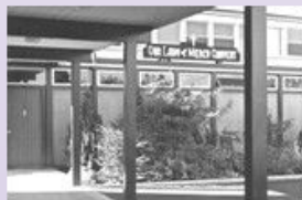
1959 Our Lady of Mercy School, Burnaby, BC