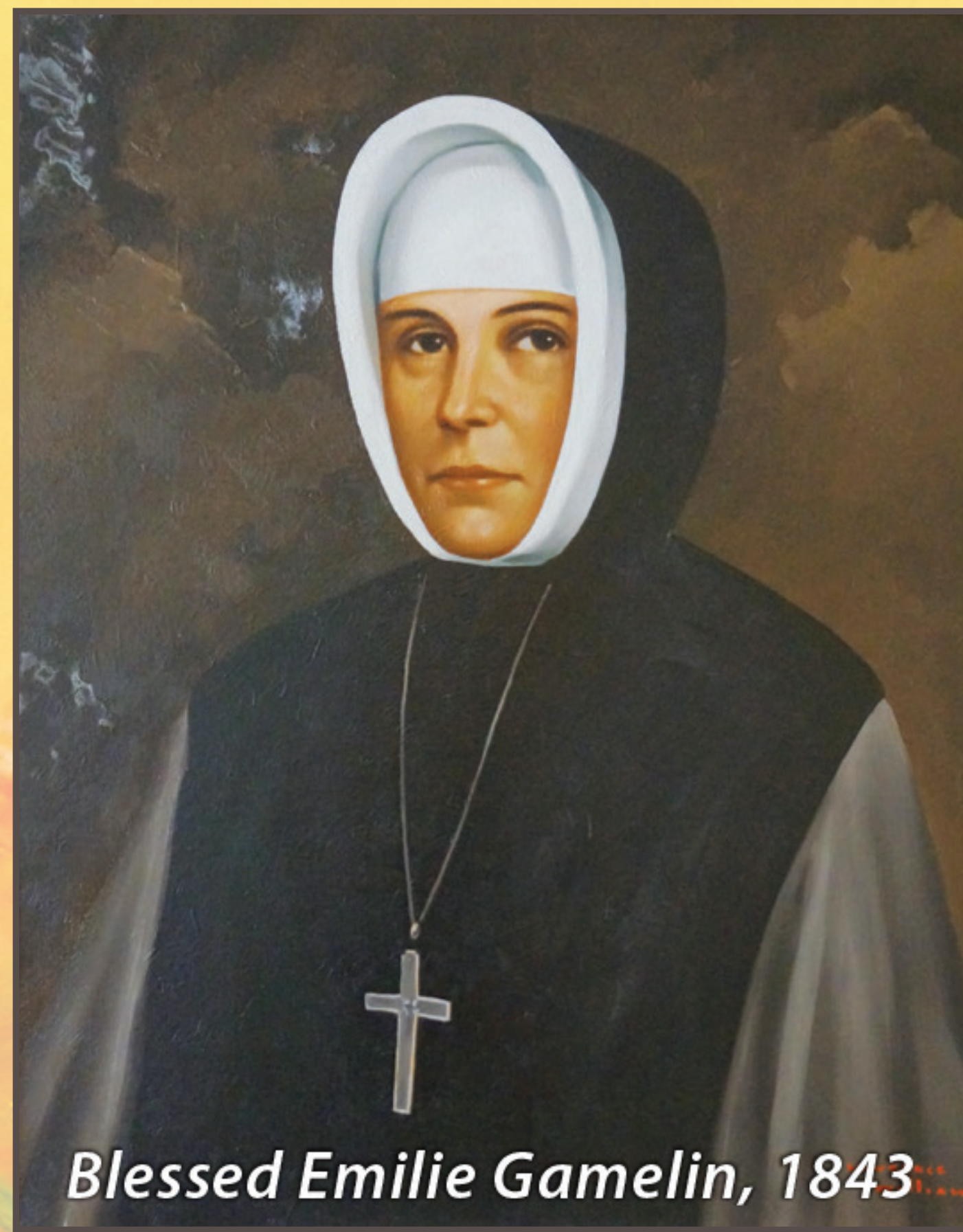
Blessed Emilie Gamelin, 1843